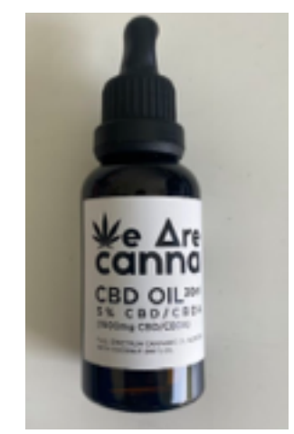
Appearance of tested sample