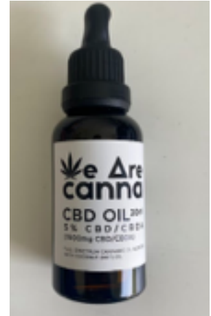
Appearance of tested sample